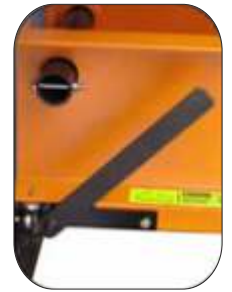
Lever lowers bed for pressing, raises it for rolling.