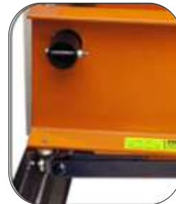
Bearings make bed positioning smooth and easy.