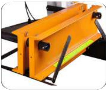
Width adjust from 4" to over 27" is secured with locking bolts.