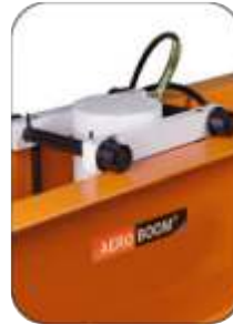
Cylinder is easily moved across width of upper bolster.