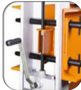
Lifting screw and locking pins make bolster raising a one-man job.